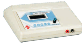
NERVE STIMULATOR (LCD)